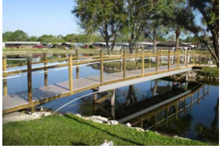
Beautification Bridge on Lake Antigua On time and under budget