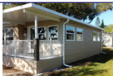
Mobile Home Repair & Remodeling. Specializing in Kitchens, Baths, Room Additions & Flooring