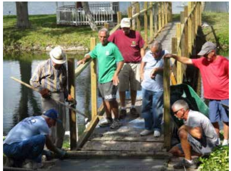
Screeding the concrete for a smooth finish.