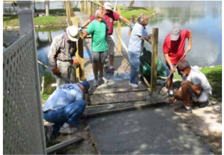
Beautification crew replacing the concrete walkway to the bridge on Lake Antigua

Submitted by Carol Basch, for Beautification