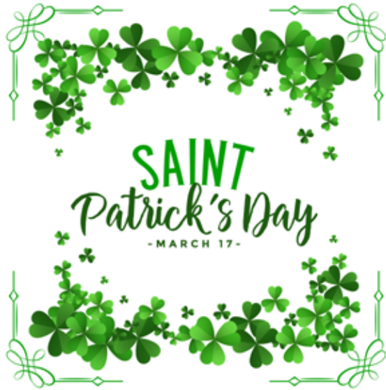
(Article on page 27)