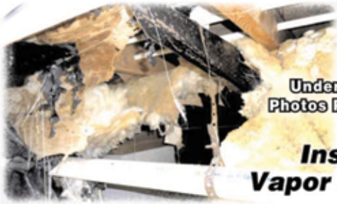
Underhome Photos Provided

Insulation Under Your Home Falling Down? Holes and Tears in Your Vapor /Moisture Barrier?