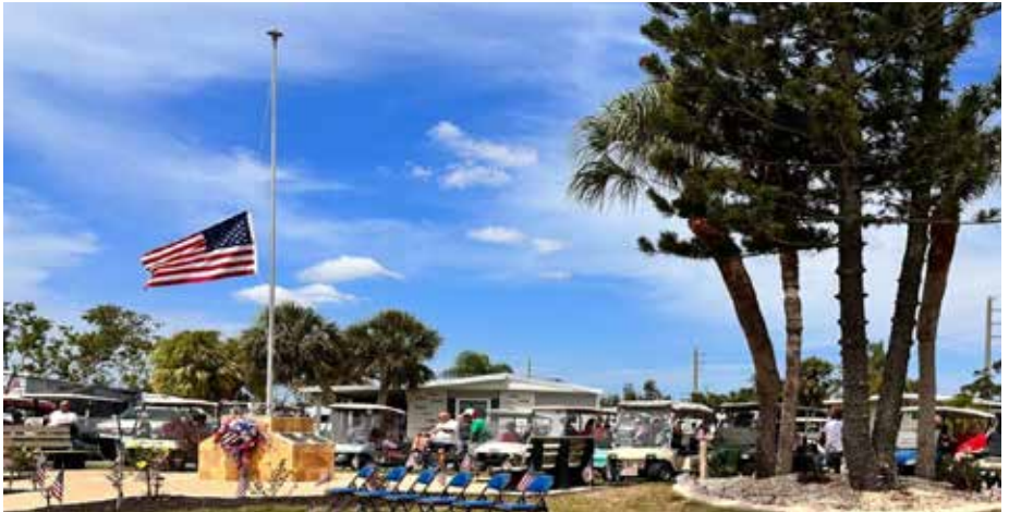
Commencement of raising the flag