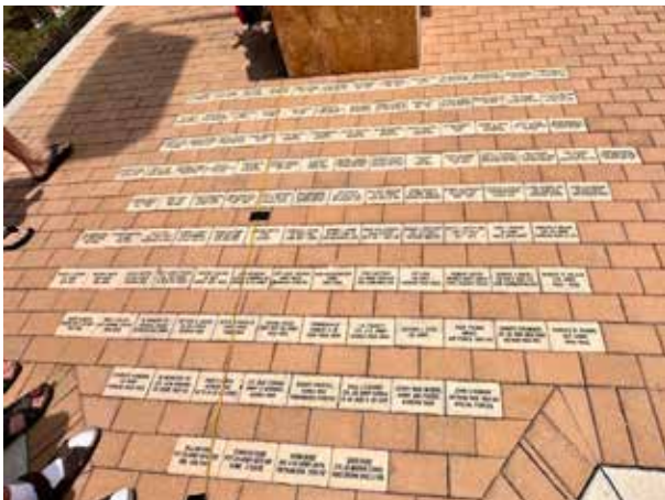
Memorial bricks of fallen Veterans.