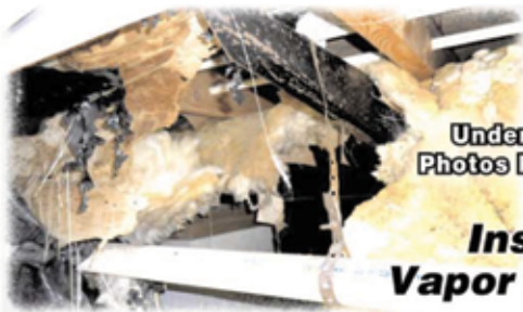
Underhome Photos Provided

Insulation Under Your Home Falling Down? Holes and Tears in Your Vapor /Moisture Barrier?